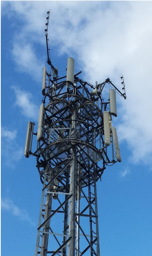
Pole-shaped Omni antenna (mobile phone communications)